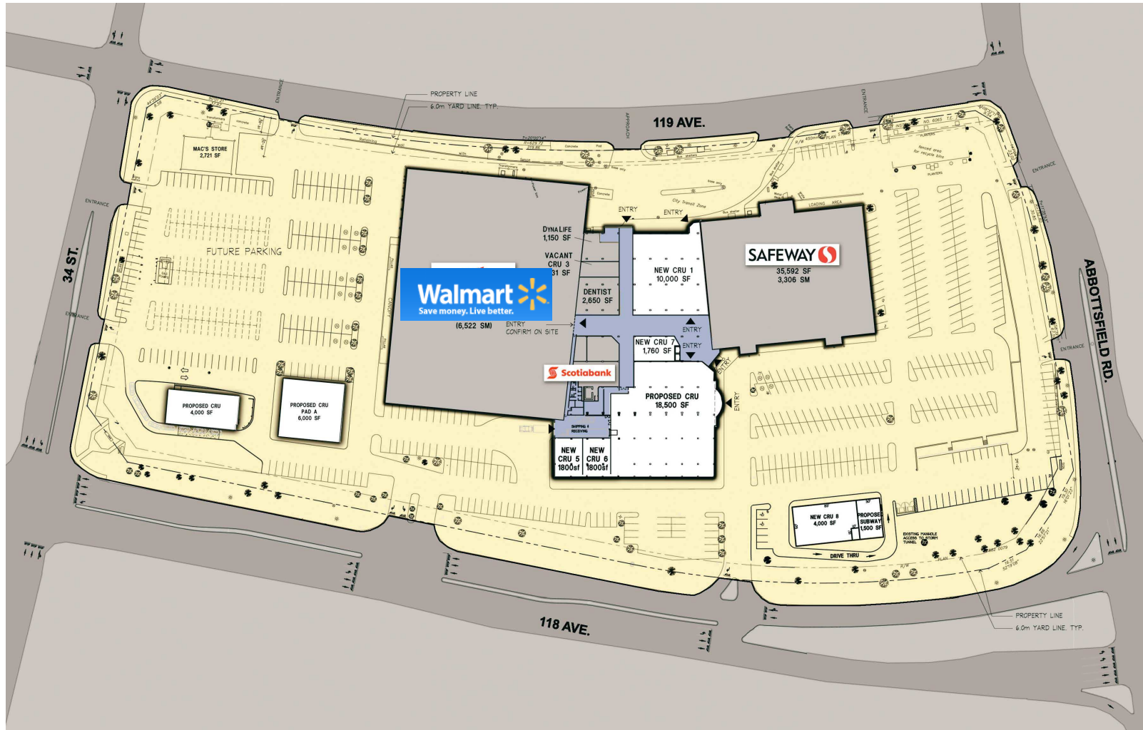
The above site plan depicts a considered redevelopment scenario